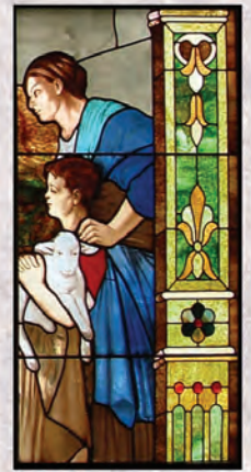
Full Service Restoration

* We also provide protective glazing and frame services.